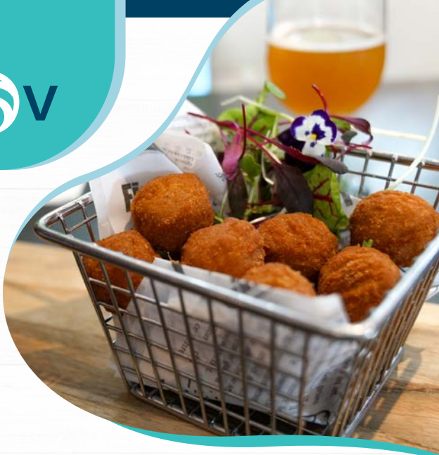
FRIED POUTINE CHEESE BITES

Chicken wings & homemade BBQ sauce 6 ~~~~~ 12 50 12 ~~~~~ 18 50