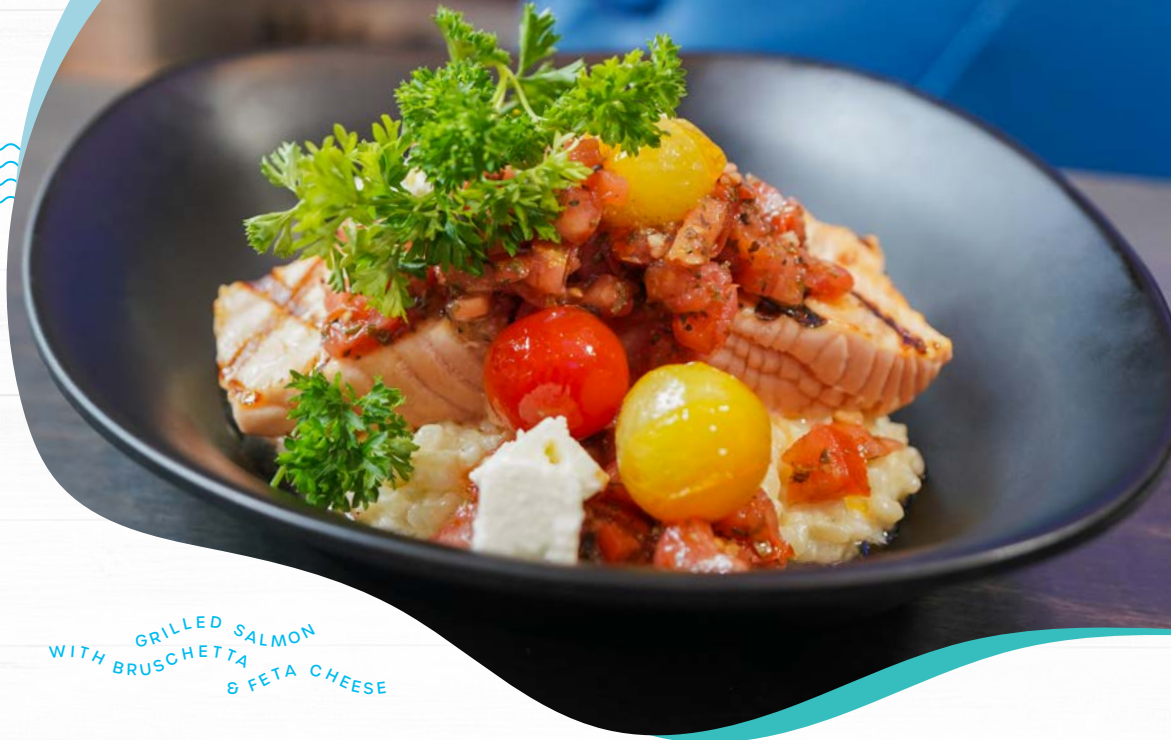
GRILLED SALMON WITH BRUSCHETTA & FETA CHEESE

Grilled salmon with bruschetta & feta cheese ~~~~~ 30 75 Salmon pavé topped with homemade bruschetta, served with risotto and vegetables of the day