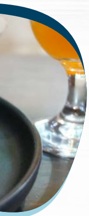
BEEF FLANK STEAK

Chicken breast stuffed with duck & cranberries ~~~~~ 28 75 Chicken breast, pink peppercorn sauce, served on risotto and vegetables of the day