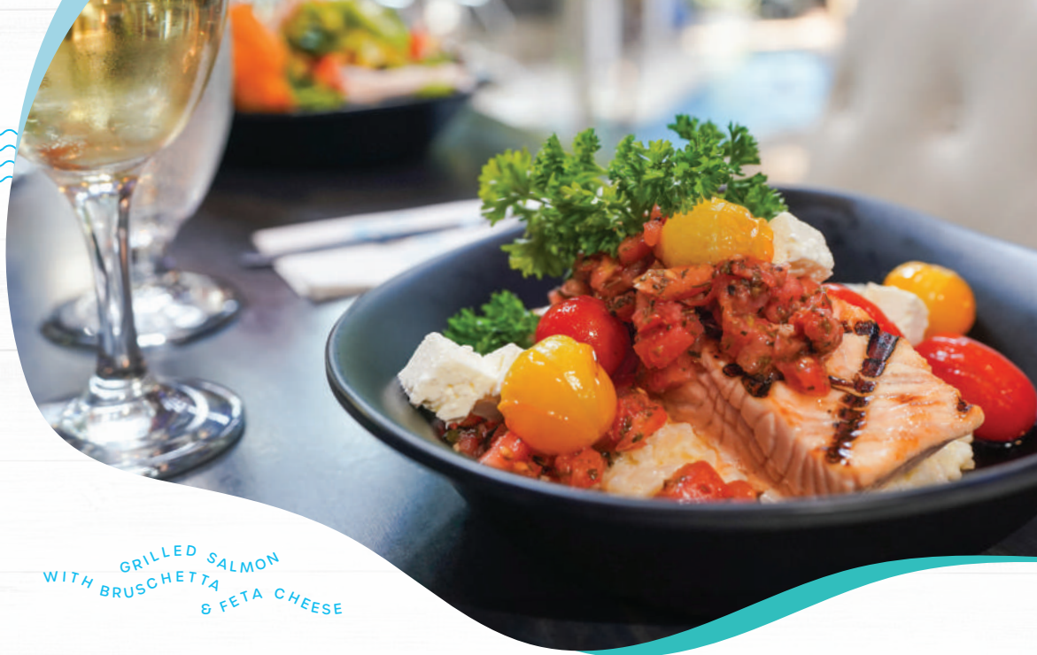
GRILLED SALMON WITH BRUSCHETTA & FETA CHEESE

Salmon pavé topped with homemade bruschetta, served with lemon-confit risotto and vegetables of the day