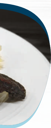
CHICKEN BREAST STUFFED WITH DUCK & CRANBERRIES

Chicken breast, pink peppercorn sauce, served on lemon-confit risotto and vegetables of the day