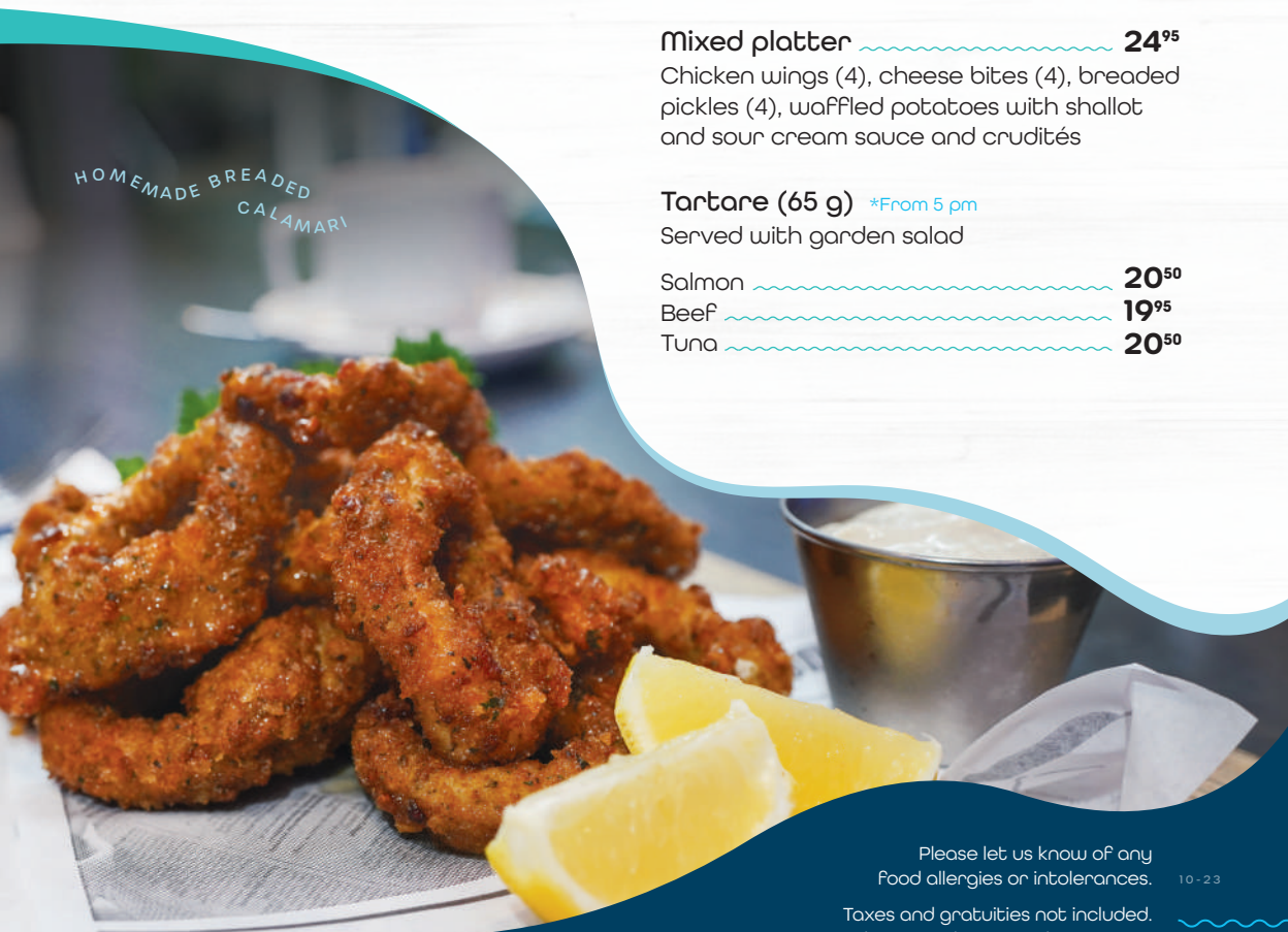
HOMEMADE BREADED CALAMARI

Please let us know of any Food allergies or intolerances.